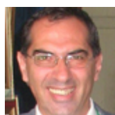
MENDAME AKRAM Councilor of the President of the Republic (Gabon - Africa) Vice President